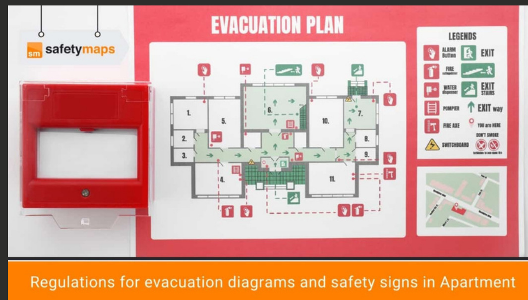
Regulations for evacuation diagrams and safety signs in Apartment